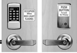
Keypad w/ Privacy