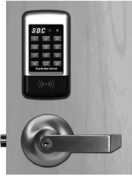
Keypad w/ Prox Reader