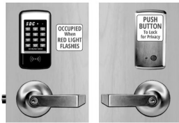
Keypad w/ Prox Reader & Privacy